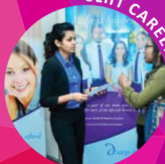
SLIIT CAREER WEEK