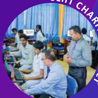
SLIIT CHARITY PROJECT