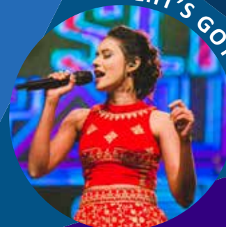
SLIIT'S GOT TALENT