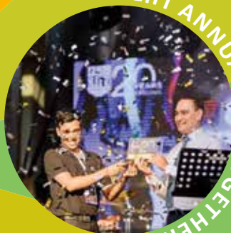
SLIIT ANNUAL GET TOGETHER