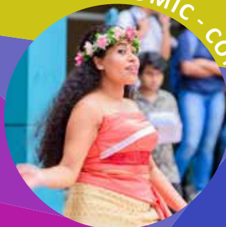
COMIC - CON